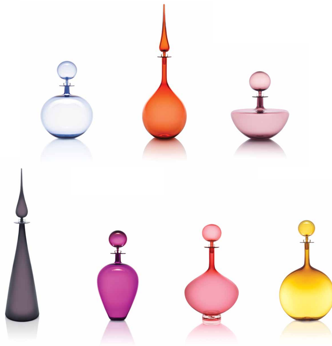
From left to right. Top: Low Round, Tear Drop, Low Arc. Bottom: Straight Cone, Wine Jug, Genie Bottle, Flask.