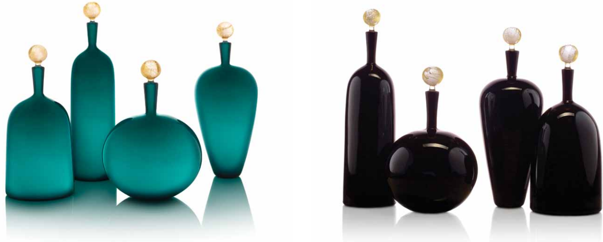
Shown in Azure from left to right: Wide Bottle, Tall Bottle, Low Round, High Shoulder.