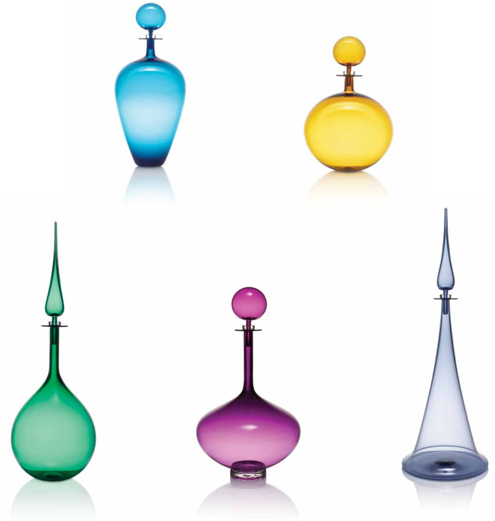
From left to right. Top: Wine Jug, Low Round. Bottom: Tear Drop, Genie Bottle, Fluted Cone.